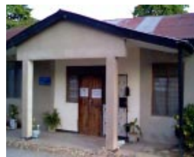
Freestanding Clinic Dar es Salaam

Comment: Transmission rates among serodiscordant couples are quite high in most places in sub-Saharan Africa, even when people know that they are living with HIV. The difficulty is that this information is frequently not shared with the partner. A couples counseling strategy allows the disclosure and discussion of risk reduction to take place in a neutral environment with a counselor who can negotiate through the difficulties of disclosing such sensitive information.